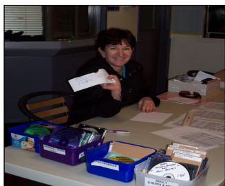
Busy at the Registration Desk

The New Zealand National Championships have come and gone for another year with a number of new National Champions crowned. A huge thank you must go to the North Island Ice Skating Sub-Association and the Nationals Organising Committee for the wonderful effort in making the 2009 NZ National Championships a success. The work done by this group is to be