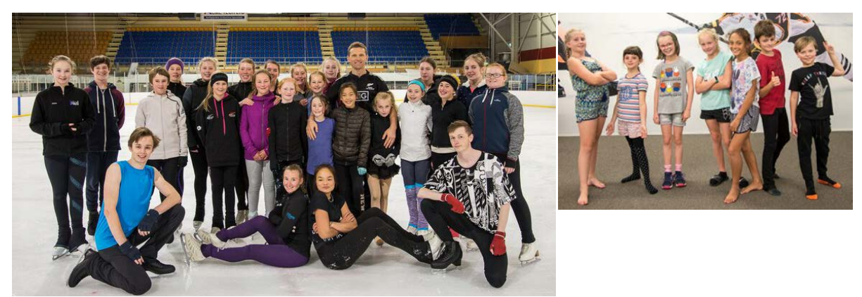
28 skaters attended the main camp and 10 skaters the "junior" camp in Dunedin