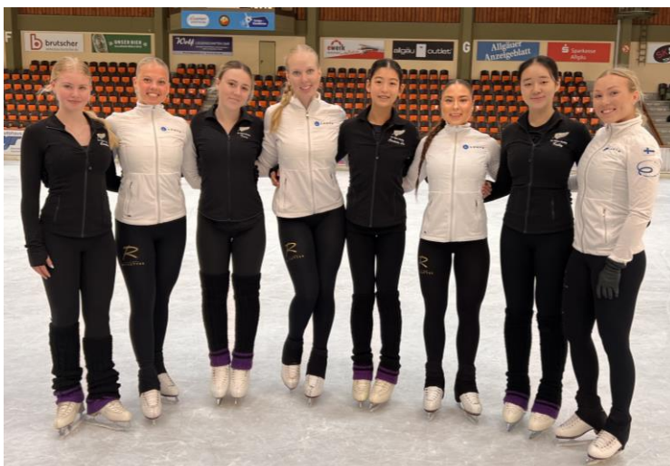
Titanium team members with Helsinki Rockettes team members