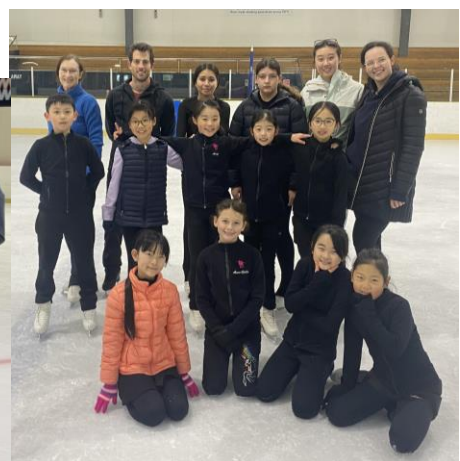
Auckland Pre Elem – Juvenile Camp