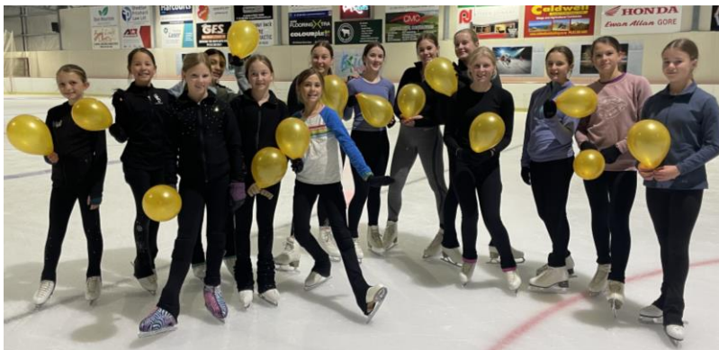
Gore Pre Elem - Juvenile Camp