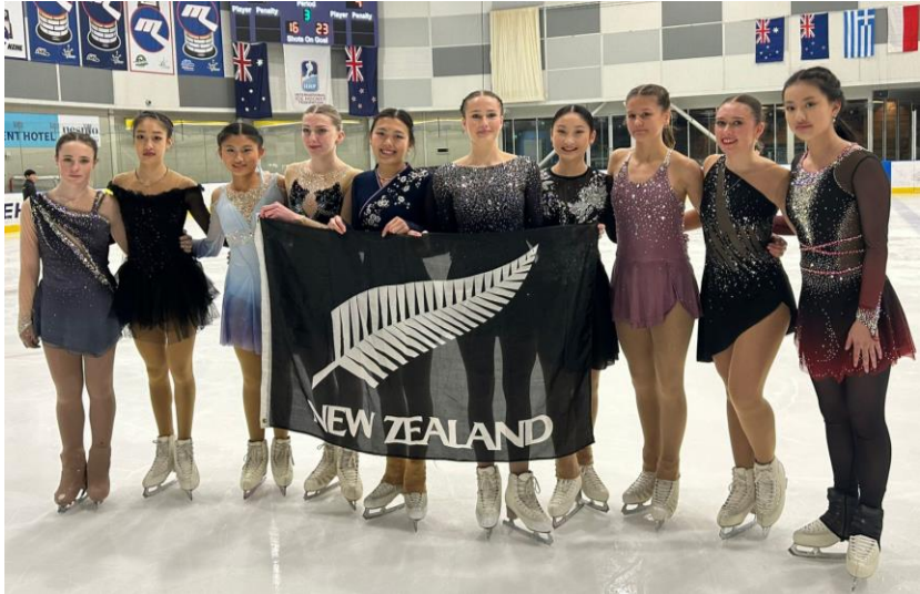
NZL Advanced Novice, Junior & Senior skaters