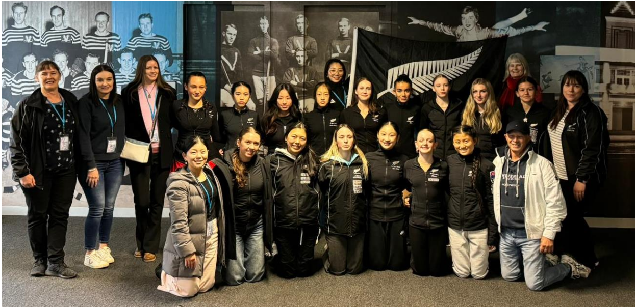
The NZL 2024 Oceania Team