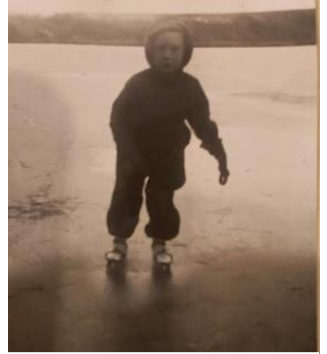
Going solo on double runner blades - about 2 years of age

Her dad played ice hockey and her mum was a recreational skater.